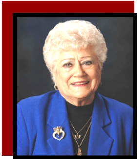
Mayor Margie L. Rice City of Westminster

"The LORD is good, a refuge in times of trouble. He cares for those who trust in Him" Nahum 1:7